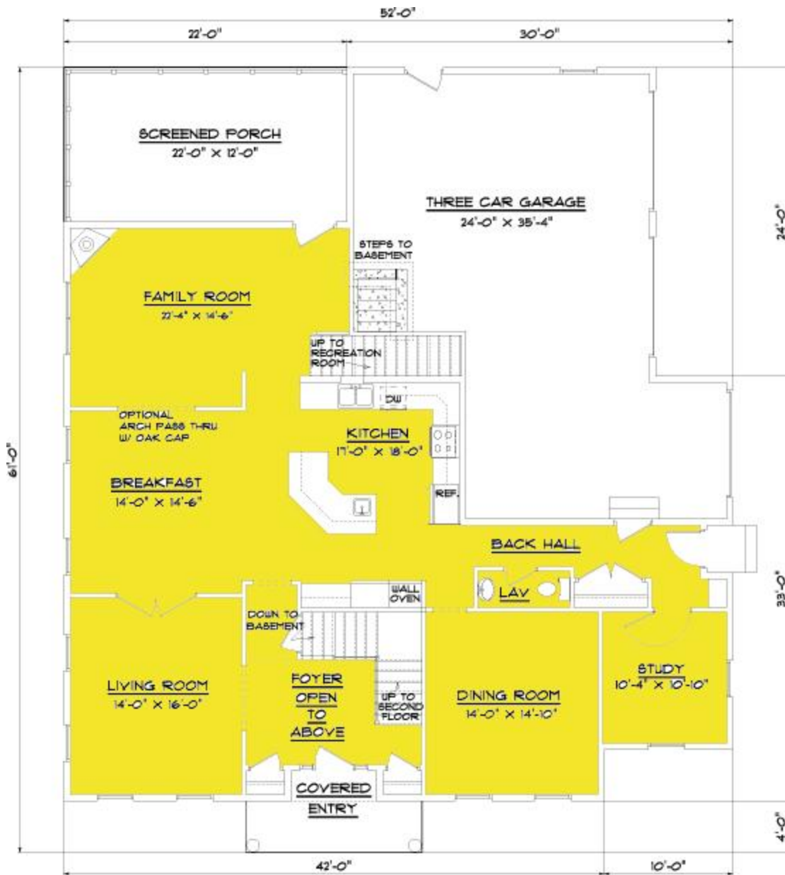
FIRST FLOOR PLAN LIVING SPACE 1,692 SQ'